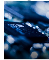
First Last, MD Assistant Dean Office of Student Affairs & Admissions (Open Position)