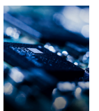
First Last OSS I - Office of Faculty Affairs & Media (Open Position)