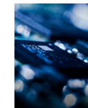
First Last Director of Assessment & Evaluation (Open Position)