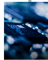
First, Last Assistant Dean Office of Research (Open Position)